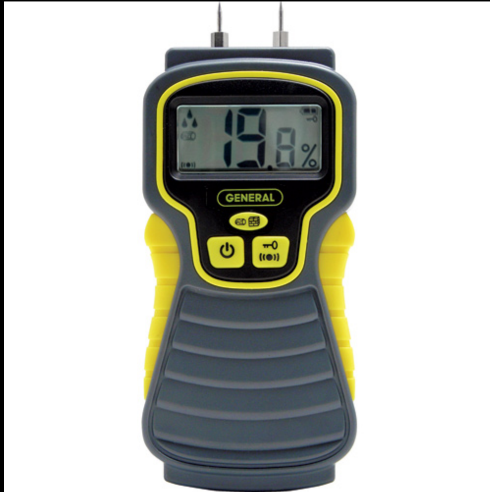
Pin Type LCD Moisture Meter