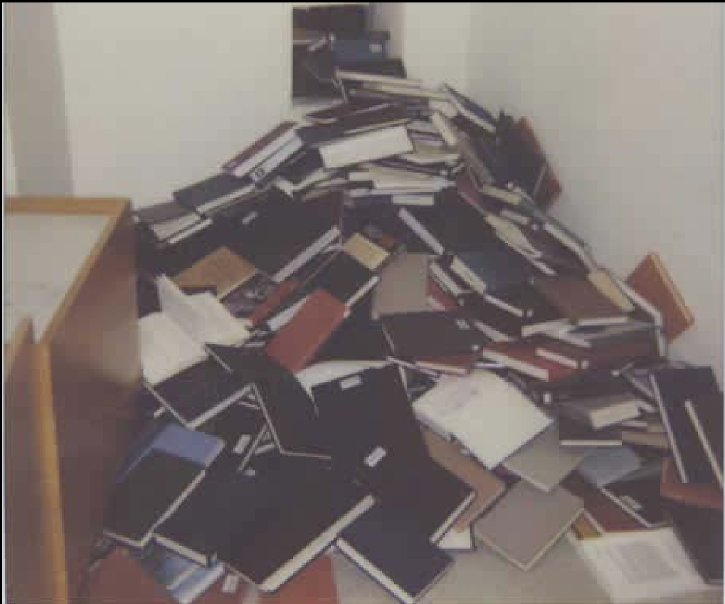
End of Semester Book Drop Returns (2004)